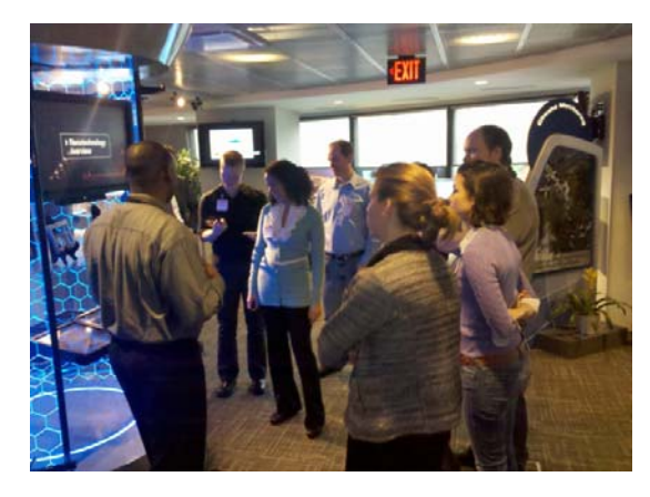
GWSS members learn about Lockheed Martin's sustainable technology R&D at its Global Vision Center.

GWSS organized a trip to the Lockheed Martin Global Vision Center on March 11. The group was given a tour of the green technologies showroom, followed by a tour of the Space Experience Center. Included in the tour were briefings on existing and forthcoming technologies, simulator time, and a reception to conclude the event. •