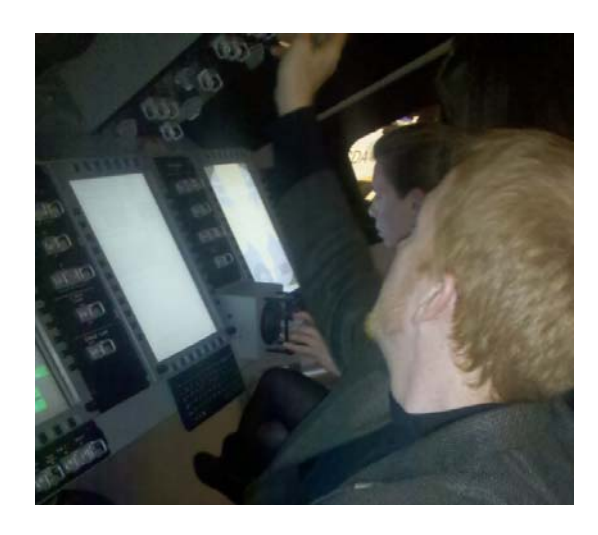
GWSS members get a hands-on feel for the Orion simulator at the Lockheed Martin Space Experience Center.