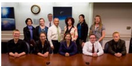
The NASA Program Management class with NASA Administrator Charles Bolden

Students also learned about the 3D modeling involved in the making of the IMAX film Hubble3D , the intricacies of creating images out of the data Hubble returns, and some preliminary findings regarding the nature of galactic halos based on Hubble data.